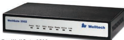
For WellGate 3502 Dimension : 165mm(W) x 25mm(H) x 100mm(D) Weight(unit): 0.7 kg