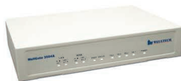
For WellGate 3504A Dimension : 223mm(W) x 35mm(H) x 152mm(D) Weight : 1.5kg